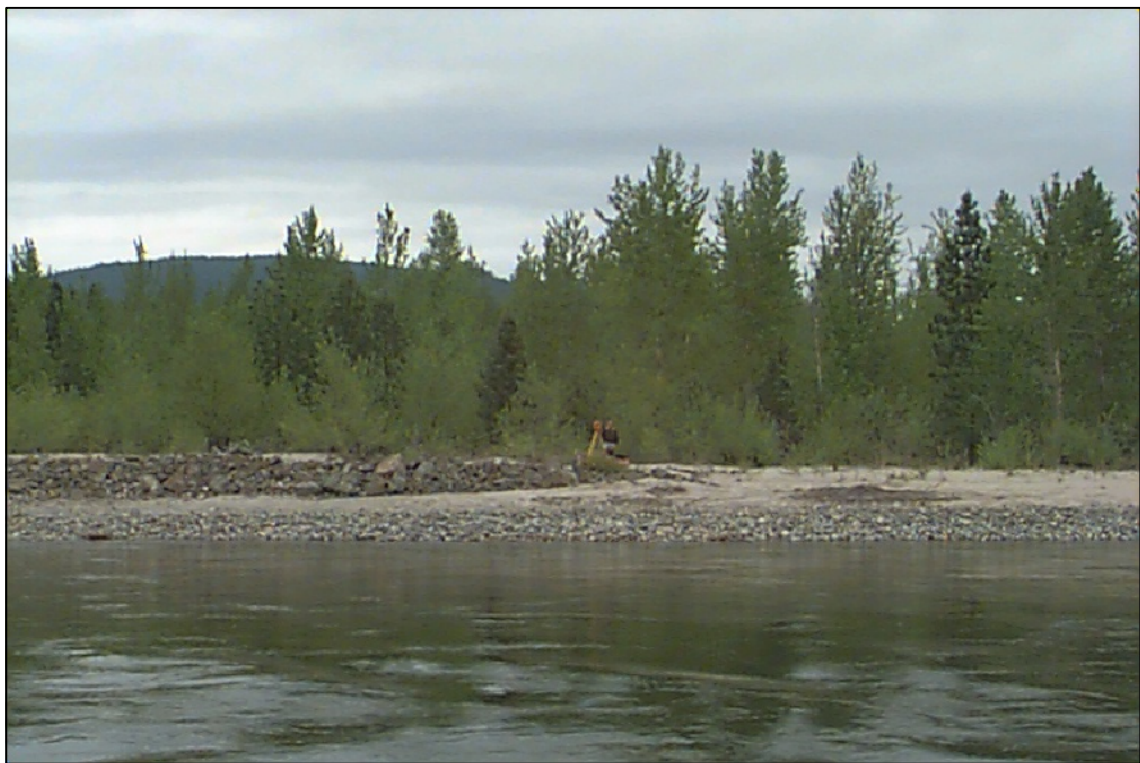
RIGHT BANK VIEW