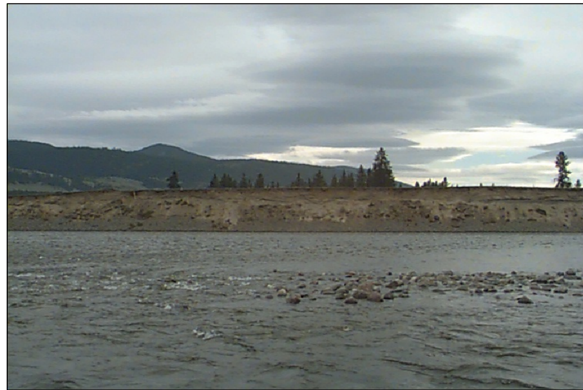
LEFT BANK VIEW